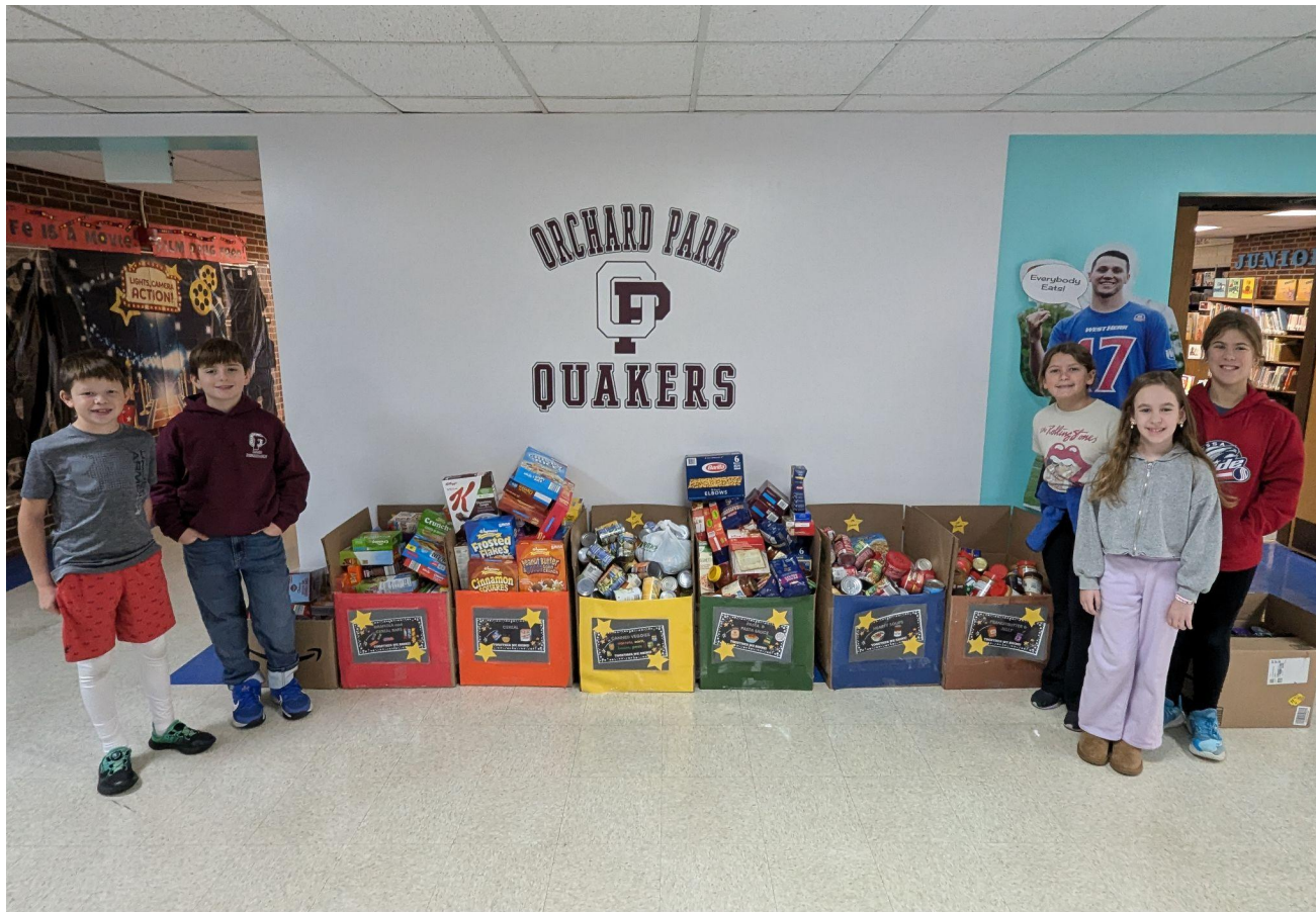
South Davis Food Drive