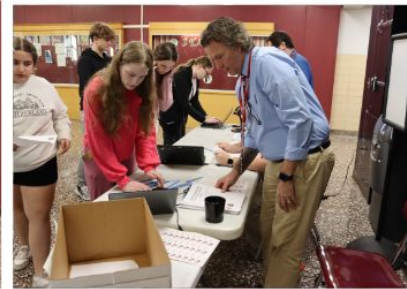
Mock Vote at the High School