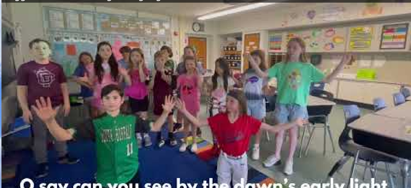
Eggert's American Sign Language Club

In addition to cultural knowledge, students acquired practical ASL skills, learning basic signs such as greetings, the alphabet, food, sports, and colors. The club concluded on a high note with students learning to sign the National Anthem. Please check out the video below to see the students perform what they learned and demonstrate some of their favorite signs.