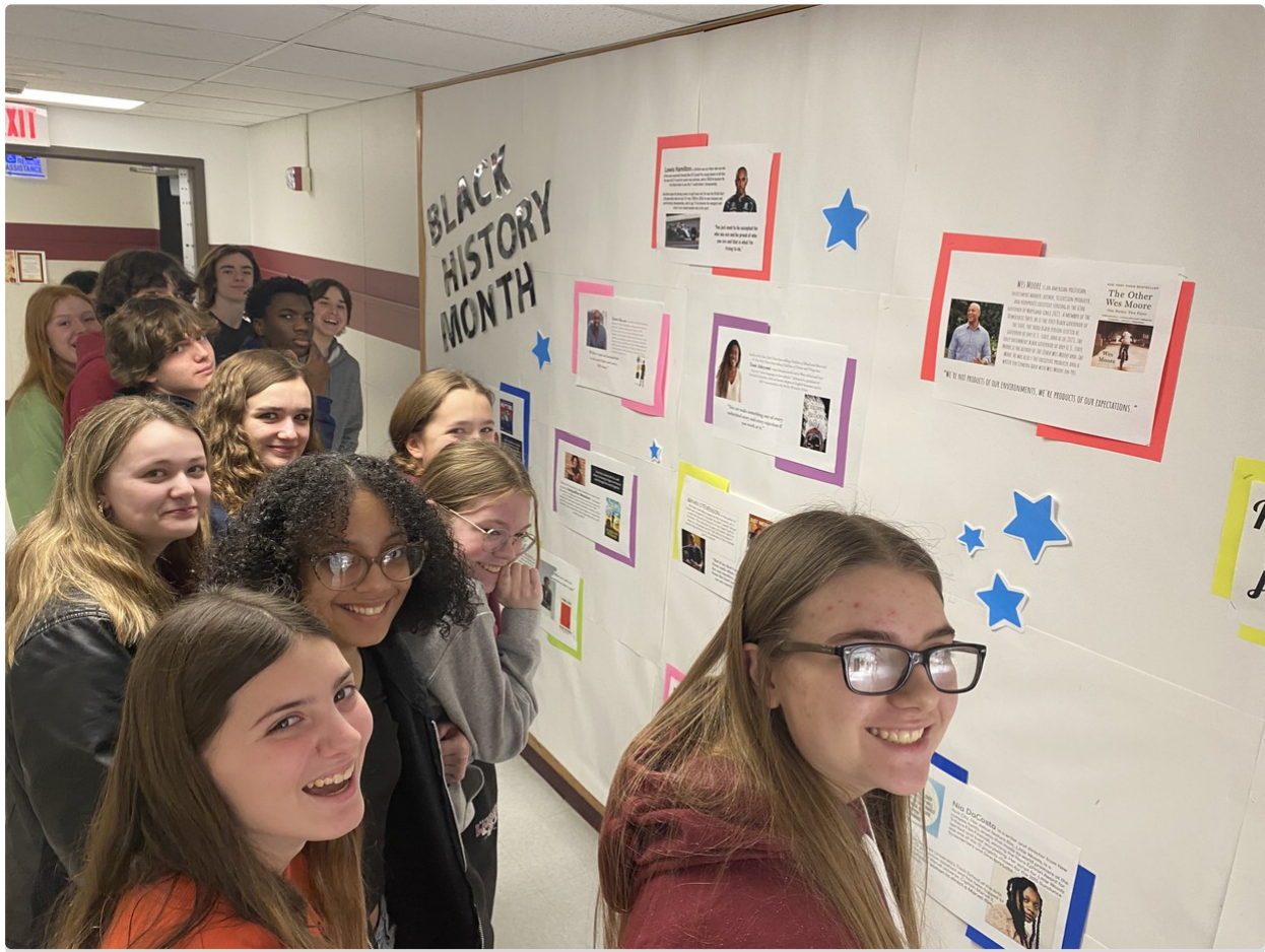
February Athletic Signing