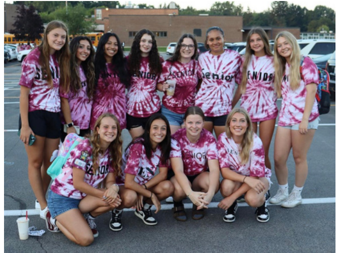
Excited Seniors on their first day back in their tie dye!!