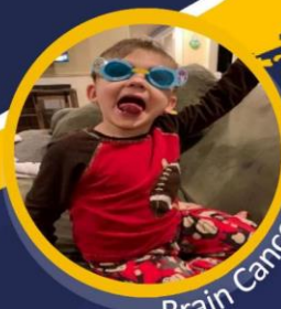
Brain Cancer Warrior