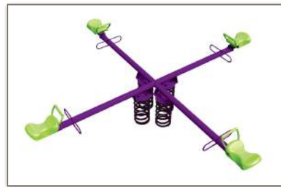
Four Seat Seesaw