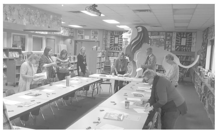
Windom teachers participated in a "Book Tasting," which allowed them to "sample" different books recommended by fellow colleagues. The teachers walked around, found a book that looked interesting, and previewed its contents before deciding whether to add it to their "menu" of book choices.