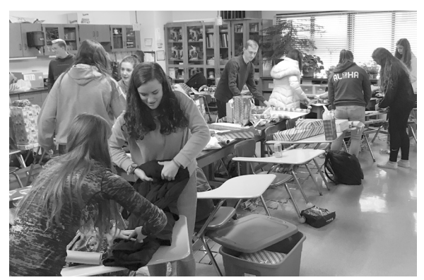
On Wednesday, December 12<sup>th</sup> STAP Comm students wrapped gifts for the three families they were assisting for the holidays this year.

Every year, STAP Comm works with Roswell Park to provide a joyful holiday to a family suffering with the hardships of cancer. During November, members of STAP Comm