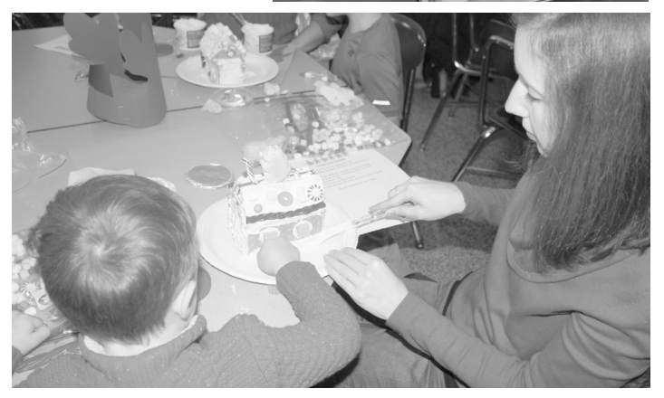
On Friday, December 14<sup>th,</sup> Windom Elementary kindergarten students were joined by their parents to make gingerbread houses in the Windom Elementary Cafeteria.

Eggert Elementary Kindergarten students performed holiday songs at their winter performance on Friday, December 14<sup>th</sup>. Parents were able to come in to view the show.