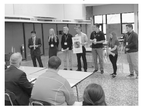
Academy of Finance seniors present to the "Shark Tank" at the Work-Based Learning Conference.

At this year's conference, students attended grade-specific sessions that are beneficial to the students. These included an interview competition, Shark Tank competition, internship overview, career clusters, and a panel discussion. The Career Clusters allowed students to explore different options and talk to local business professionals about exactly what their jobs and experiences are like. The interview session allowed students to use their resumes and practice their interviewing skills. The day as a whole is an opportunity for the students to work on their soft skills. Students are asked to dress professionally, meet and talk to Academy of Finance Board members and other community business members. This gives the students