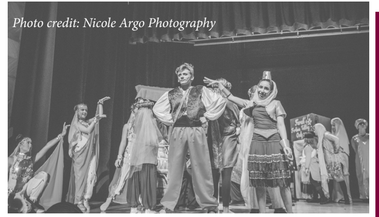
Orchard Park Middle School performed Disney's "Aladdin, Jr." from November 29<sup>th</sup>-December 1<sup>st</sup>. The show was a new adaptation to the Academy Award-winning film, "Aladdin."