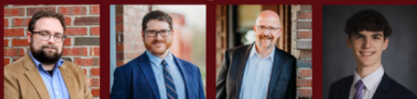
2024-2025 Board of Education